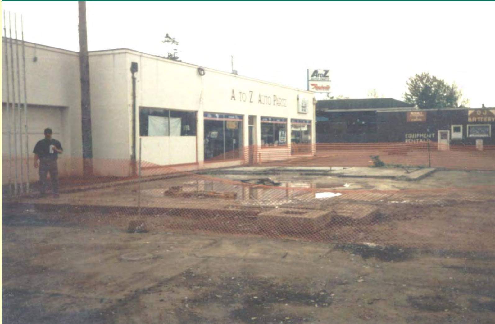
Independence Library Project - former A to Z Auto Parts