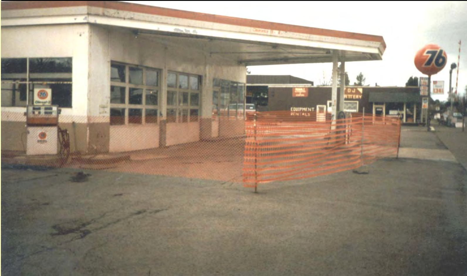
Independence Library Project & former Indy 76 Gas Station