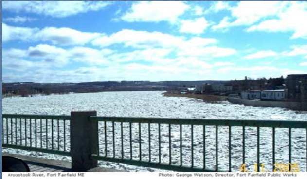
Aroostook River, Fort Fairfield ME